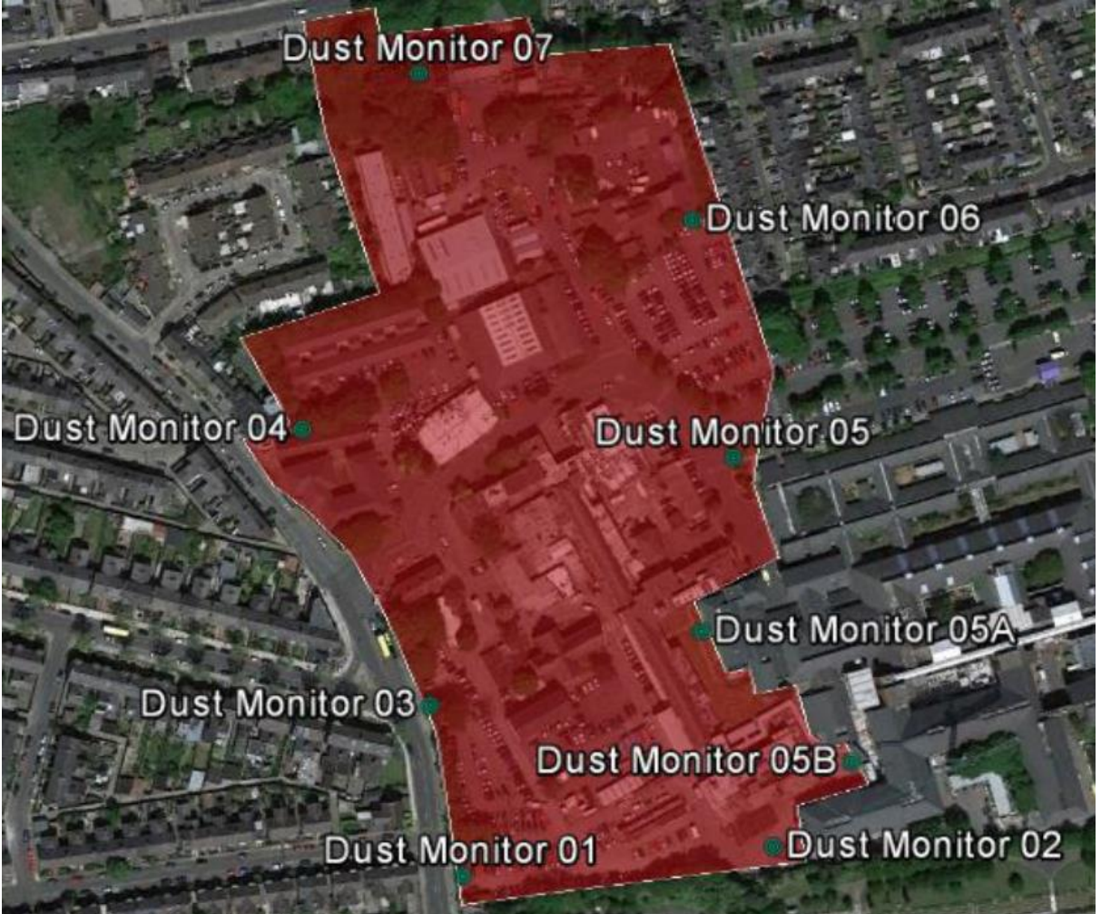
Figure 2. Previous location of Dust monitors on site (April 2017 to August 2017).